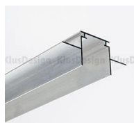
extrusion TEKNIK (B5555)