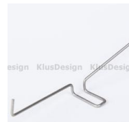
spring GP (00293)