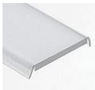
cover type HS22 frosted (17011) clear (17022)