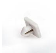
TEKNIK clip (24003)