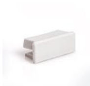
end cap GIZA without hole (24007)